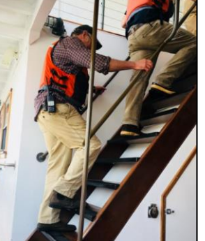
Stairs from main deck to skiff deck